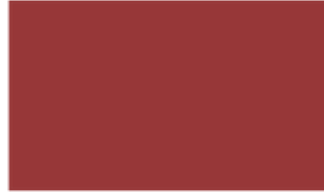
Brown Red - RAL NO. 3011