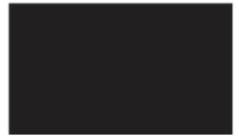
Jet Black - RAL NO. 9005