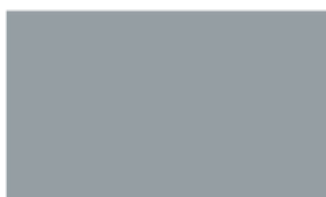
Squirrel Grey - RAL NO. 7000