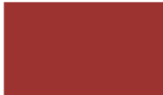
Brown Red - RAL NO. 3011