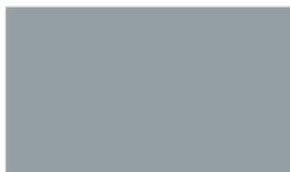
Squirrel Grey - RAL NO. 7000