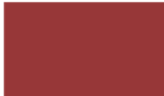
Brown Red - RAL NO. 3011