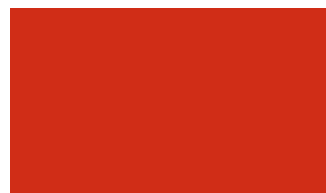
Traffic Red - RAL NO. 3020