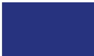
Ultramarine Blue - RAL No. 5002