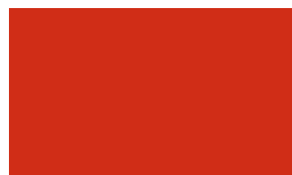
Traffic Red - RAL NO. 3020