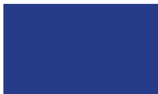
Ultramarine Blue - RAL No. 5002