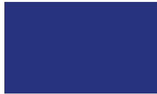
Ultramarine Blue - RAL No. 5002