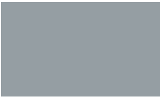
Squirrel Grey - RAL NO. 7000