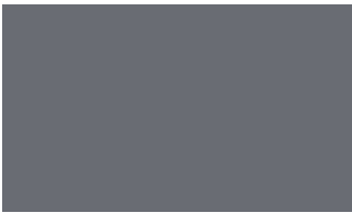
Slate Grey - RAL NO. 7015