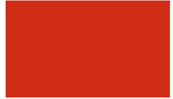
Traffic Red - RAL NO. 3020