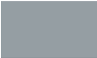
Squirrel Grey - RAL NO. 7000