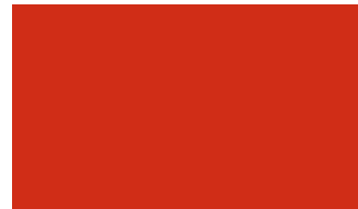
Traffic Red - RAL NO. 3020