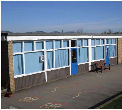
THE SITE >>