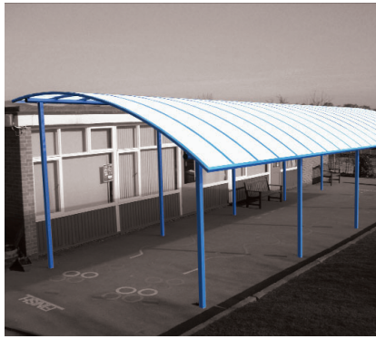
THE VISUAL >>